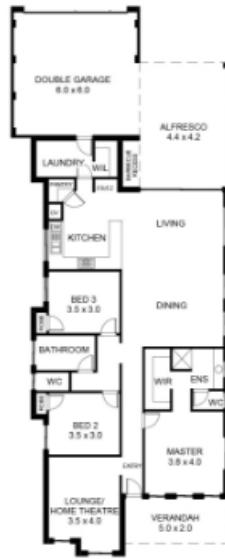
16 Elemi Bend, Atwell