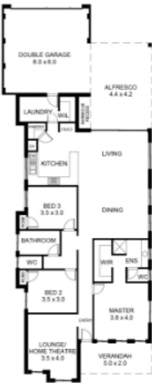
16 Elemi Bend, Atwell