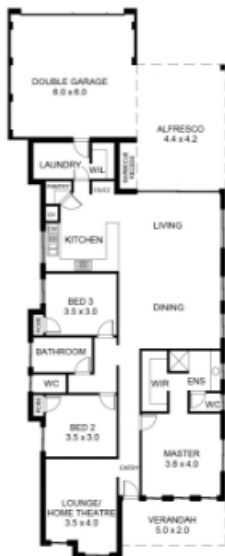
16 Elemi Bend, Atwell