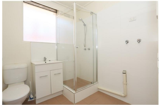
16/552 Moreland Road, Brunswick