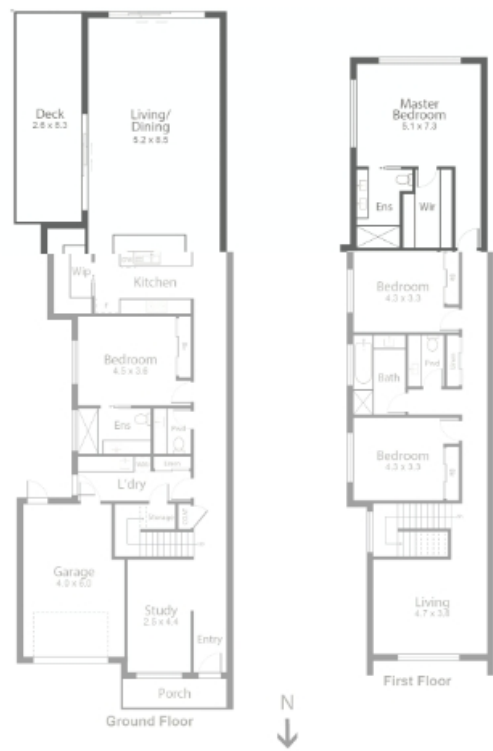
12B Mortimore Street, Bentleigh