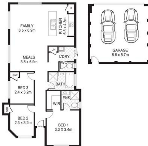
12 ST TROPEZ GARDENS, PIARA WATERS

DISCLAIMER: PLANS SHOWN ARE FOR MARKETING PURPOSES ONLY. ALL DIMENSIONS ARE APPROXIMATE AND NOT TO SCALE. THEY ARE SUBJECT TO ERRORS AND INACCURACIES AND NO LIABILITY WILL BE ACCEPTED. INTERESTED PARTIES SHOULD MAKE THEIR OWN INQUIRIES.