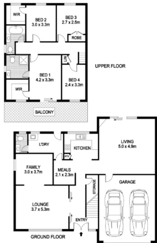
12 SAUNDERS STREET, COMO

DISCLAIMER PLANS SHOWN ARE FOR MARKETING PURPOSES ONLY. ALL DIMENSIONS ARE APPROXIMATE AND NOT TO SCALE. THEY ARE SUBJECT TO SURVEY AND ENCUMBRANCES AND NO LIABILITY WILL BE ACCEPTED. INTERESTED PARTIES SHOULD HAVE THEIR OWN INQUIRY.