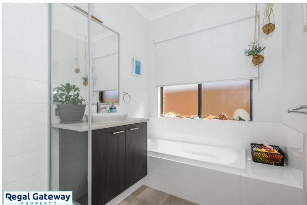
Regal Gateway PROPERTY