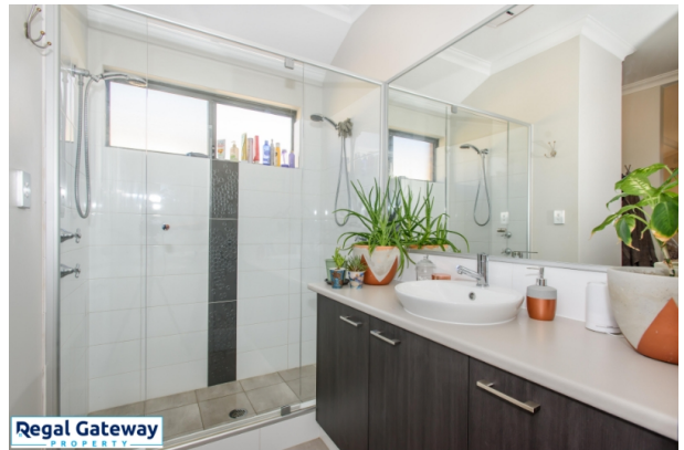
Regal Gateway PROPERTY