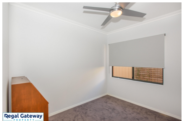
Regal Gateway PROPERTY