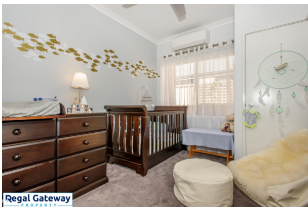
Regal Gateway PROPERTY