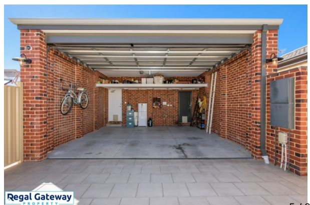
Regal Gateway PROPERTY