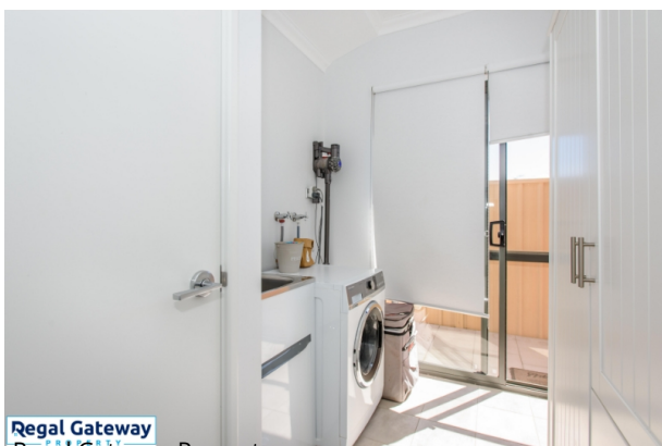
Regal Gateway PROPERTY Regal Gateway Property