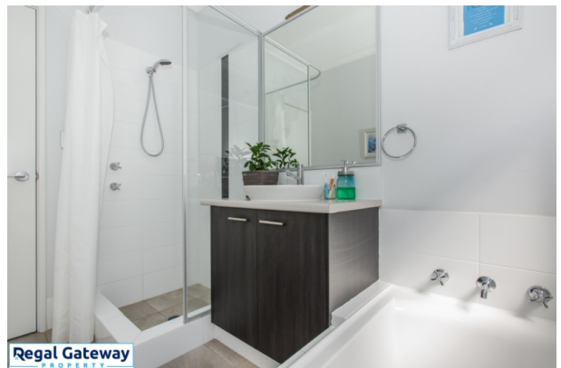
Regal Gateway PROPERTY