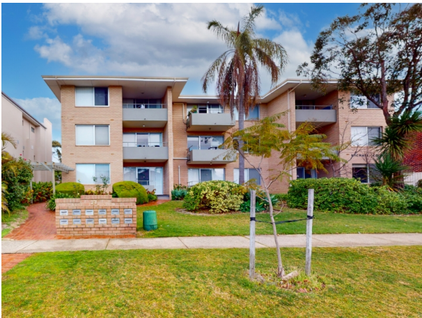
Unit 12, 27 Adair Parade, Coolbinia