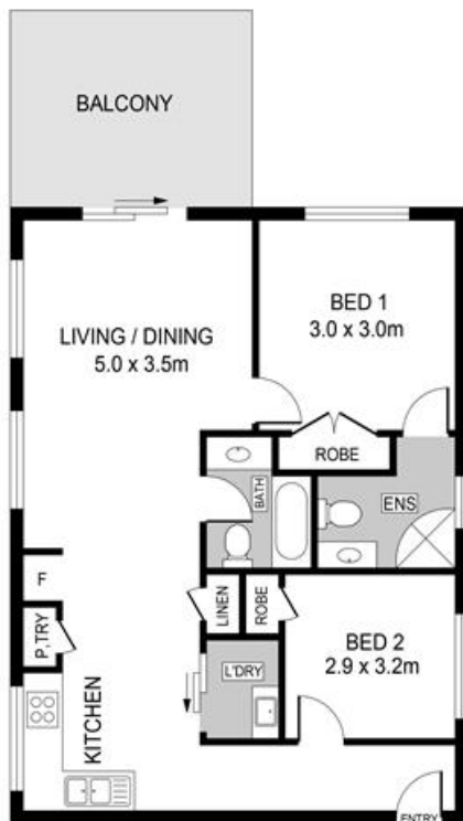
12/12 DALZIELL STREET, MADDINGTON

DISCLAIMER: PLANS SHOWN ARE FOR MARKETING PURPOSES ONLY. ALL DIMENSIONS ARE APPROXIMATE AND NOT TO SCALE. THEY ARE SUBJECT TO ERROR AND INACCURACIES AND NO LIABILITY WILL BE ACCEPTED. INTERESTED PARTIES SHOULD MAKE THEIR OWN INQUIRIES.