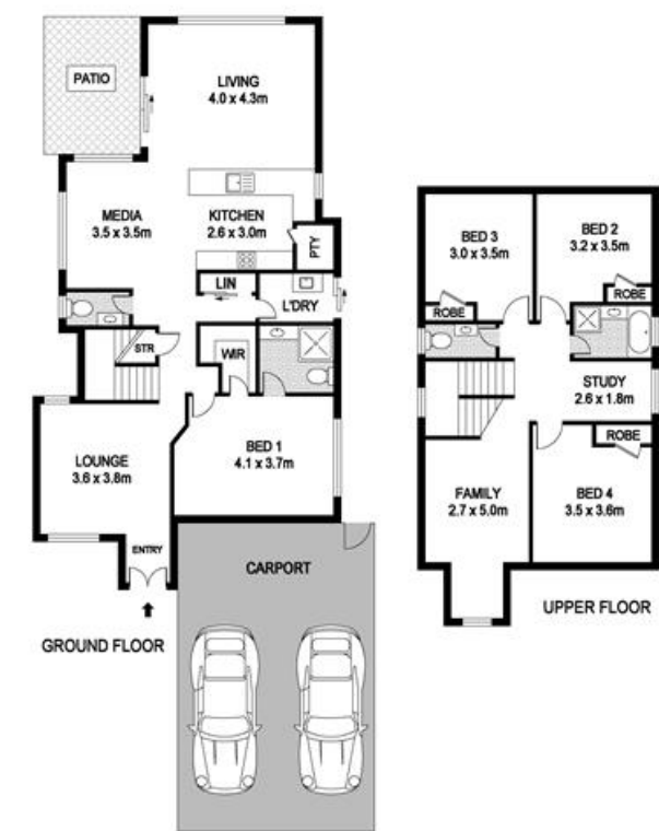
116A COODE STREET, SOUTH PERTH

DISCLAIMER PLANS SHOWN ARE FOR MARKETING PURPOSES ONLY. ALL DIMENSIONS ARE APPROXIMATE AND NOT TO SCALE. THEY ARE SUBJECT TO ERRORS AND INCONVENIENCES AND NO LIABILITY WILL BE ACCEPTED. INTERESTED PARTIES SHOULD MAKE THEIR OWN INQUIRIES.