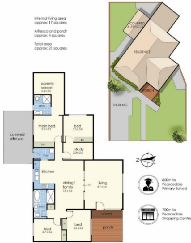
10 Feltham Street, Pearcedale