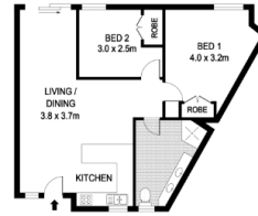
10-54 NANNINE PLACE, RIVERVALE

© 2014 JONES BALLARD All rights reserved. This document is the property of Jones Ballard Pty Ltd. It is to be used only for the purpose for which it is prepared and is not to be distributed, copied, or otherwise used without the prior written consent of Jones Ballard Pty Ltd.