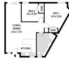
10-54 NANNINE PLACE, RIVERVALE

10-54 NANNINE PLACE, RIVERVALE 10-54 NANNINE PLACE, RIVERVALE 10-54 NANNINE PLACE, RIVERVALE