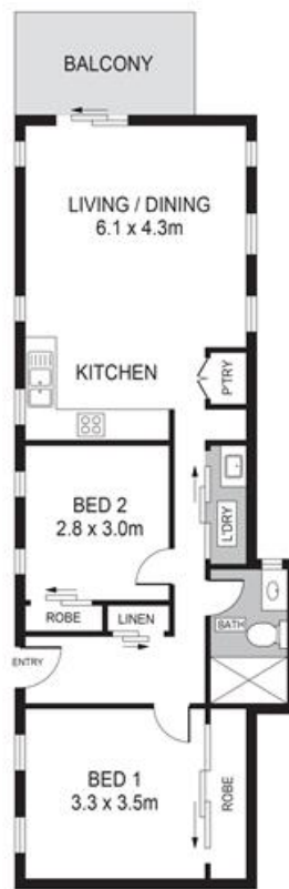
10/15 GOCHEAN AVENUE, BENTLEY

DISCLAIMER: PLANS SHOWN ARE FOR MARKETING PURPOSES ONLY. ALL DIMENSIONS ARE APPROXIMATE AND NOT TO SCALE. THEY ARE SUBJECT TO ERRORS AND INACCURACIES AND NO LIABILITY WILL BE ACCEPTED. INTERESTED PARTIES SHOULD MAKE THEIR OWN INQUIRIES.