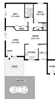
1-96 EDGE CUMBE STREET, COMO

DISCLAIMER PLANS SHOWN ARE FOR MARKETING PURPOSES ONLY. ALL DIMENSIONS ARE APPROXIMATE AND NOT TO SCALE. THEY ARE SUBJECT TO CHANGE AND DISCREPANCIES ARE NOT OUR RESPONSIBILITY. ANY CHANGES, ADDITIONS, OR DELETIONS TO ANY OF THE INFORMATION CONTAINED HEREIN WILL BE ACCEPTED. INTERESTED PARTIES SHOULD READ THE DRAWINGS CAREFULLY.