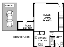
1-22 ALSTON AVENUE, COMO

DISCLAIMER: THIS PLAN IS FOR INFORMATION ONLY. ALL DIMENSIONS ARE APPROXIMATE AND SHOULD BE CHECKED ON SITE. THE PLAN IS NOT TO BE USED FOR CONSTRUCTION OR FOR ANY OTHER PURPOSE. THE INFORMATION IS NOT TO BE USED FOR ANY OTHER PURPOSE.