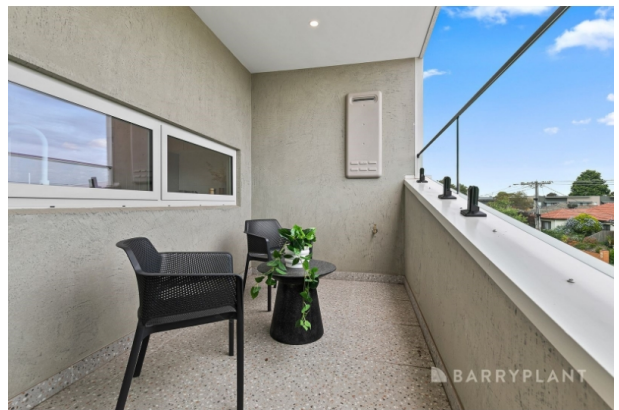
1/20 Eileen Street, Hadfield