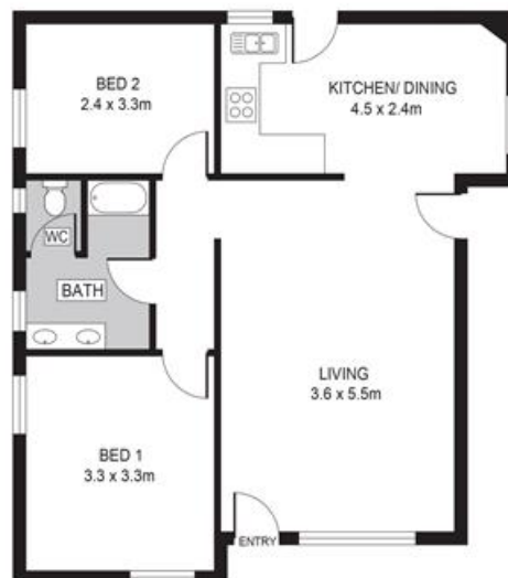
1/132 SOUTH TERRACE, SOUTH PERTH

DISCLAIMER: PLANS SHOWN ARE FOR MARKETING PURPOSES ONLY. ALL DIMENSIONS ARE APPROXIMATE AND NOT TO SCALE. THEY ARE SUBJECT TO ERRORS AND OMISSIONS AND NO LIABILITY WILL BE ACCEPTED. INTERESTED PARTIES SHOULD MAKE THEIR OWN INQUIRIES.